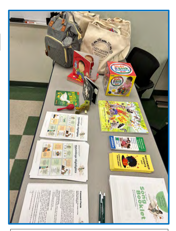
Before the Workshop Begins... In the Nest, Pilot 3, Caroline County Public Libraries