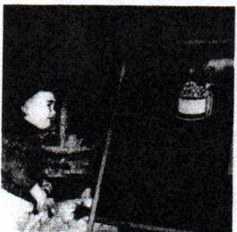
A young program participant enjoys watching peas move in and out of the pot during a program in EPFL's Night Room